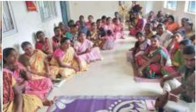
Vigilance Awareness Gram Sabha conducted by the Coir Board Regional Office, Pollachi at, Annagudi Colony, Annagudi Panchayat, Vellore, Tamil Nadu on 04.11.2022.