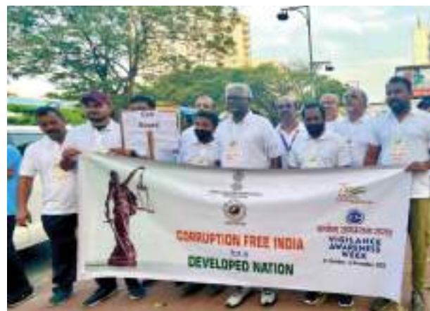
Walkathon - (a walk against corruption) held on 30.10.2022, at Kochi, Kerala