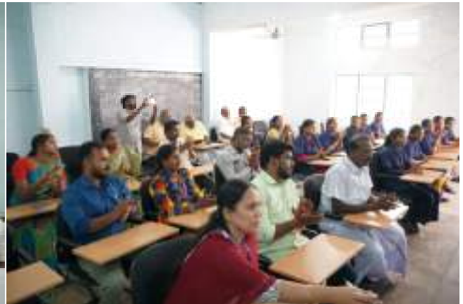
Awareness Programme conducted at the Coir Board Regional Extension Centre, Thanjavur, Tamil Nadu on 05.11.2022.