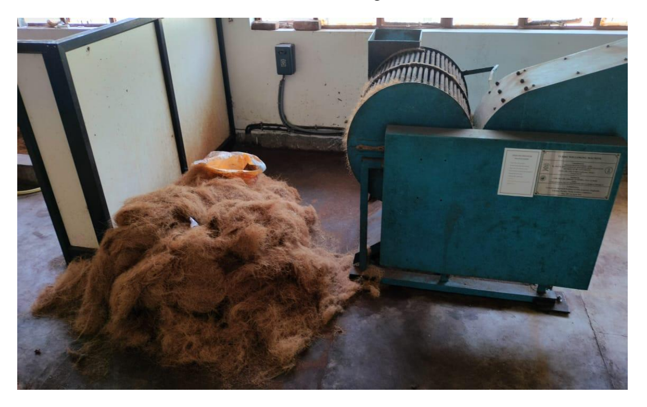
Cleaning In Progress