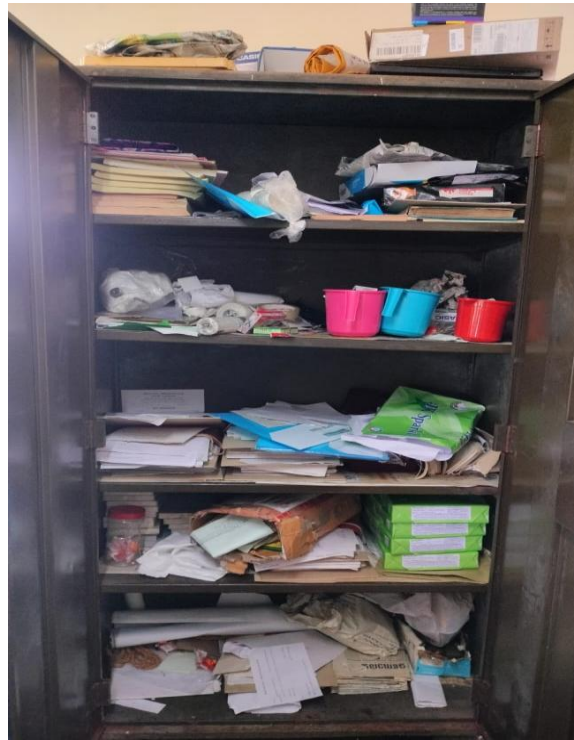
Cleaning In Progress