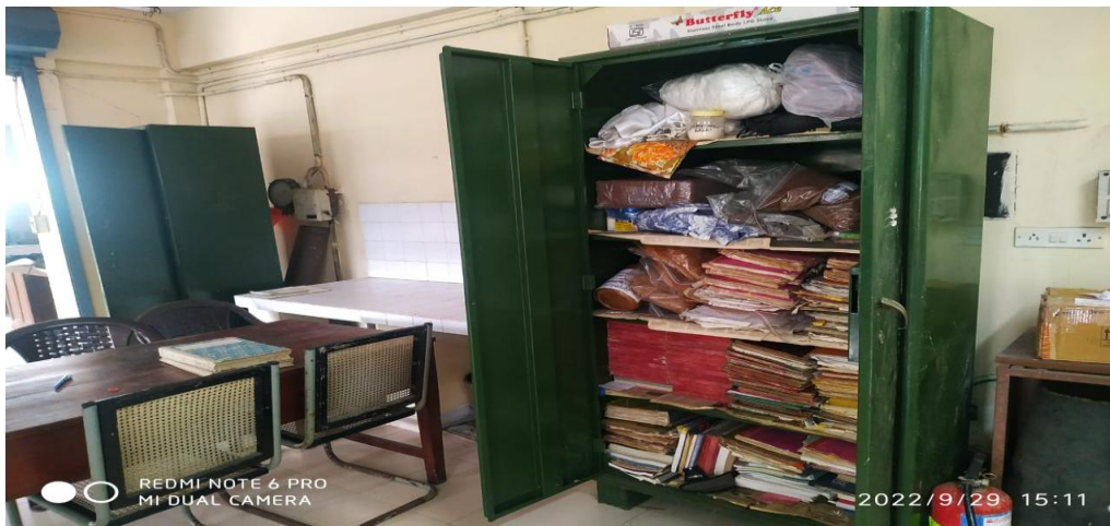
Cleaning In Progress