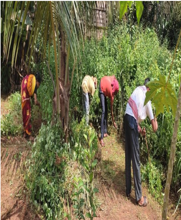
During cleaning Activities