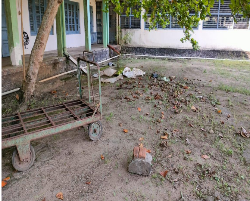
Cleaning In Progress