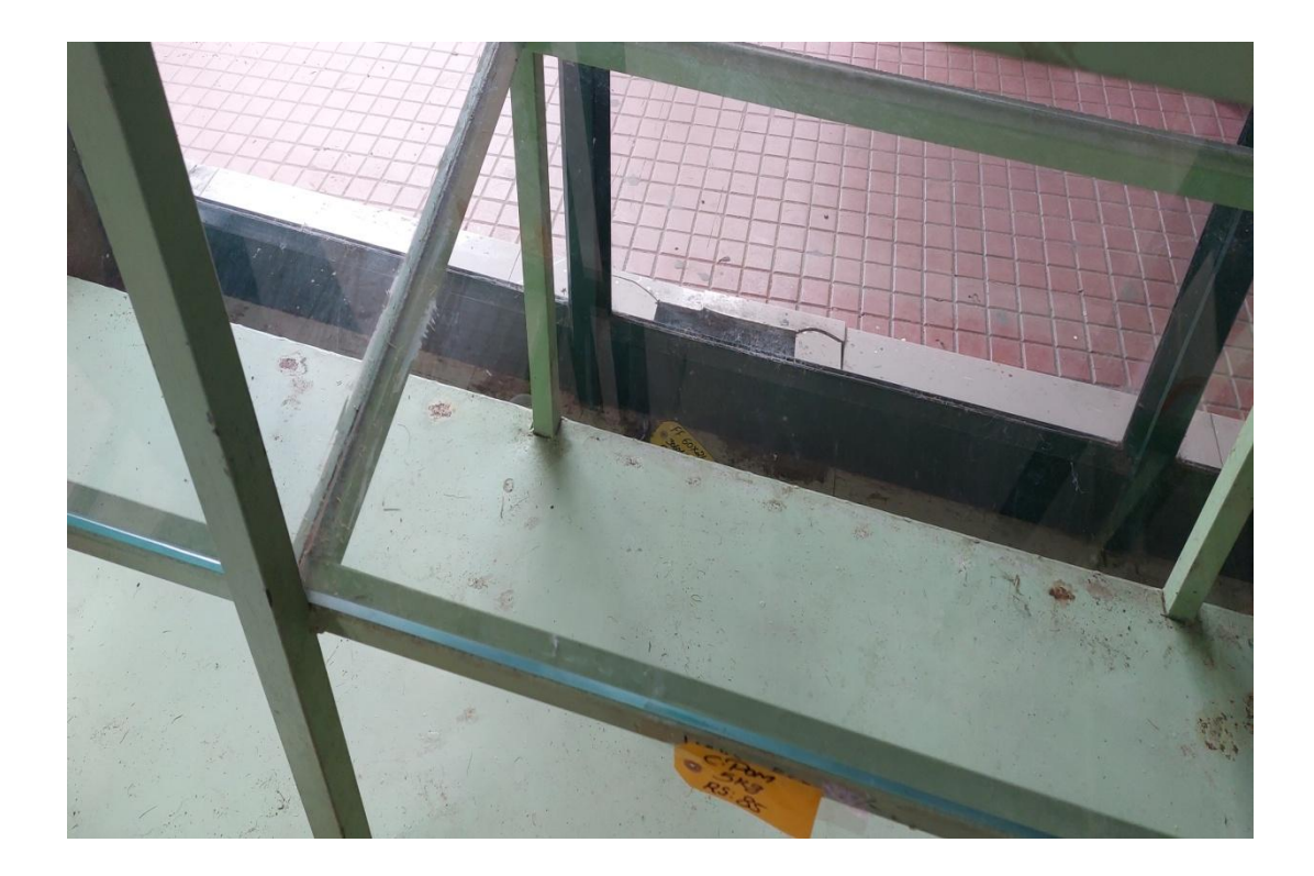
Cleaning In Progress