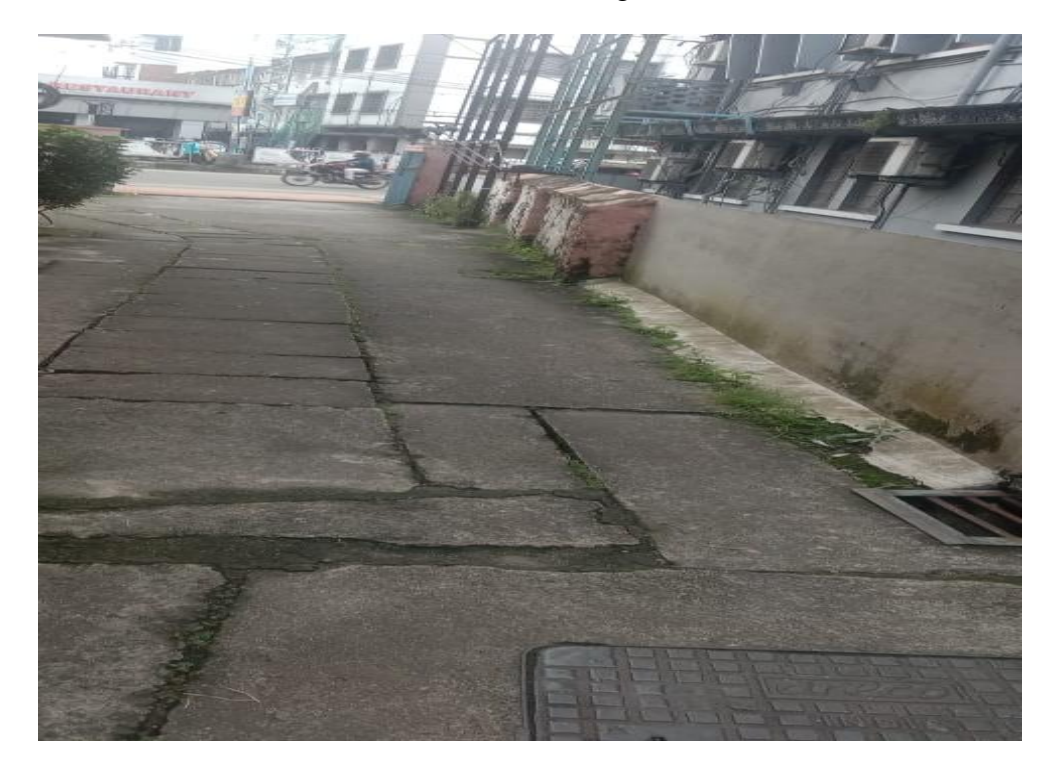
Cleaning In Progress