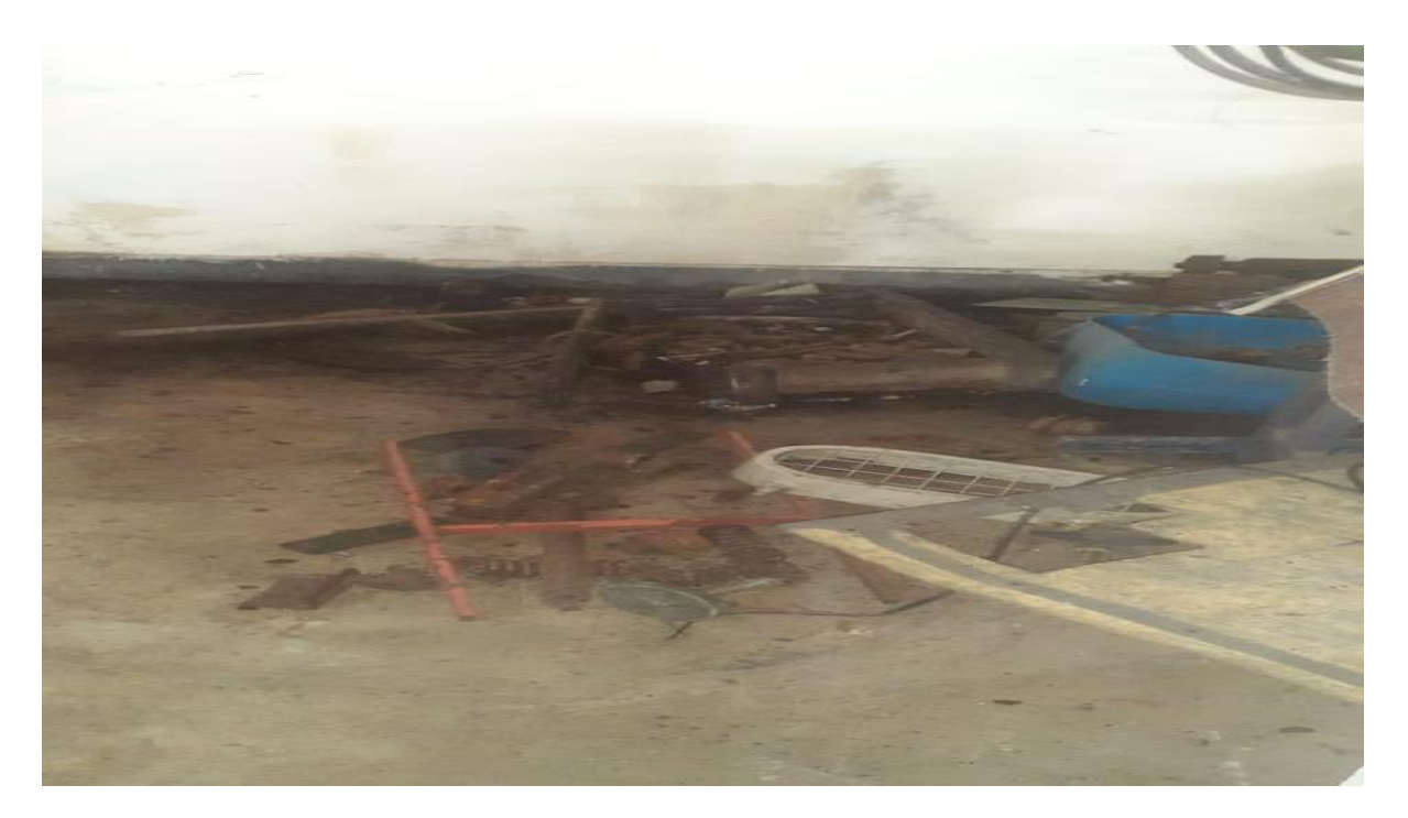
Cleaning In Progress