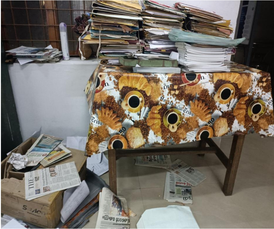
Cleaning In Progress