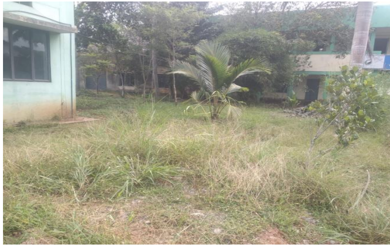
Cleaning In Progress