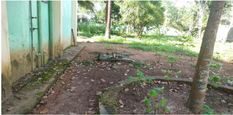
Cleaning In Progress