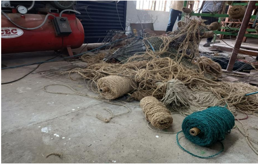
Cleaning In Progress