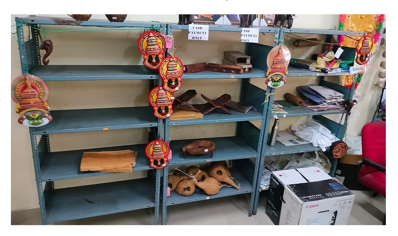
Cleaning In Progress