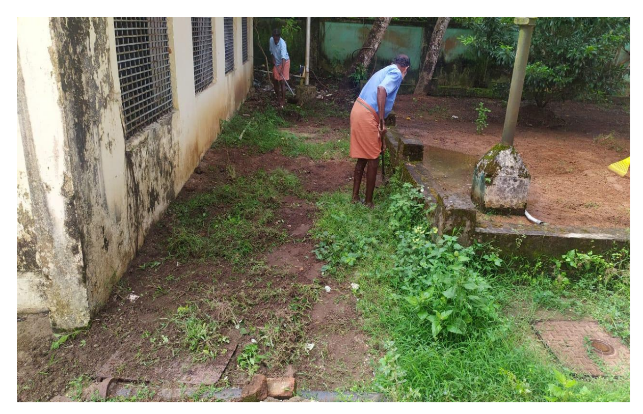
Cleaning In Progress