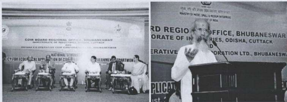
Hon'ble MOS MSME, Shri, Pratap Ch. Sarangi delivers inaugural address during national seminar held at Bhubaneswar on 24 th August 2019.