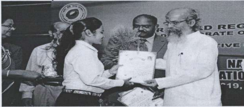
Certificate distribution to the passed out trainee of NSQF level 3 training (6 months duration) by Hon'ble MOS MSME, Shri, Pratap Ch. Sarangi

Certificates distributed to the passed out trainees of NSQF level 3 training (6 months duration) at Bhubaneswar by Hon'ble MOS MSME