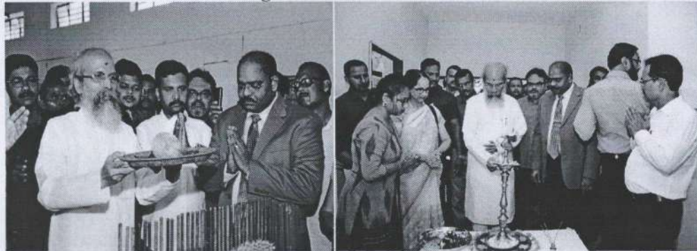
Hon'ble MOS MSME, Shri, Pratap Ch. Sarangi inaugurates the "Livelihood Business Incubation Centre" at Coir Board Regional Office Bhubaneswar