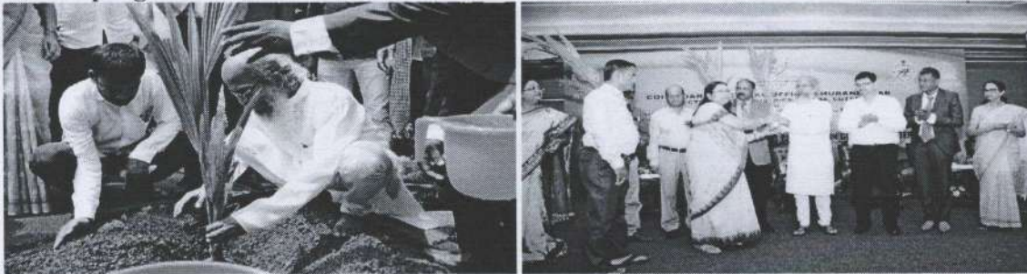
Hon'ble MOS MSME, Shri, Pratap Ch. Sarangi distributed Coconut saplings to SFURTI coir clusters under Swatchha Bharat

Coconut saplings distributed to SFURTI clusters under implementation of Swatchha Bharat programme at Bhubaneswar