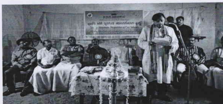
Inaugural speech by Dr.Shashi Tharoor, Hon'ble M.P in the Awareness programme at Pachalloor, Thiruvananthapuram