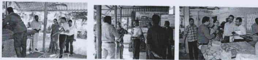
Visit of MD, MSSIDC, Mumbai