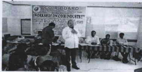
The Officer in charge, Regional Office, Rajahmundry taking technical sessions in the workshop