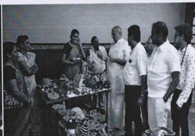
Chairman viewing the exhibits