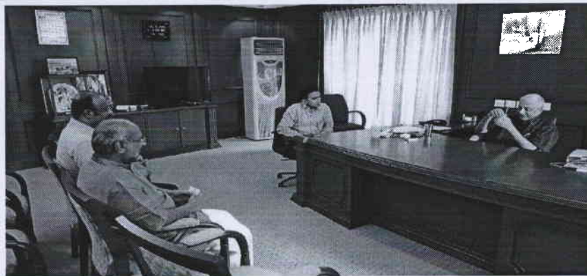
Chairman, Coir Board in discussion with the Chief Minister of Goa & Speaker of Goa Legislative Assembly

Coir Board has chalked out plans for reviving the coir industry in the State of Goa. Chairman, Coir Board held discussions with the Hon'ble Chief Minister of Goa, Shri. Manohar Parrikar and also with the Speaker of Goa Legislative Assembly Shri. Pramod Sawant to promote the Coir Industry in the state of Goa. The interactive meeting was held at the chamber of the Chief Minister on 13.07.2018. The implementation of various schemes of the Board for the development of coir industry in the state was also discussed in detail.