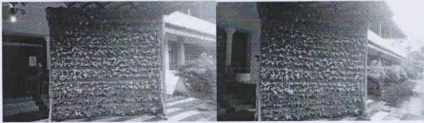
Setting up of vertical garden