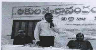
The Officer in charge, Regional Office, Hyderabad taking technical sessions in the Awareness programme