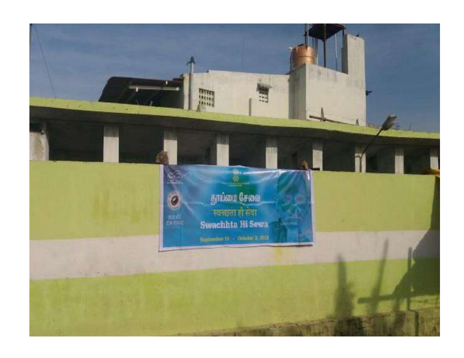
BMS Settlement Colony, Palladam, Pollachi