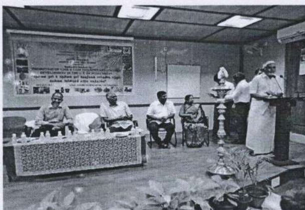
Inaugural speech by the Shri.Kamalakannan, Hon'ble Minister for Agriculture & Education, Govt. of Puducherry in the Regional Seminar

Coir Board organized a one-day Regional Seminar at Farmer's Training Hall, Thattanchavady, Puducherry on 24.05.2018 with a view to make an awareness on Coir & Coir Products and also to explore the possibilities for the development of Coir Industry in Puducherry. Shri.Kamala Kannan, Minister for Agriculture & Education, Govt. of Puducherry inaugurated the Regional Seminar. This was conducted by the Regional Office of the Board at Pollachi, TamilNadu in association with the Dept. of Agriculture, Govt. of Puducherry. Coconut Development Board also participated. Display of Coir products was also arranged in connection with the Regional Seminar "Promotion of Coir & Coir Industry and Coconut Development in UT of Puducherry. Coir Board presented technical sessions on schemes of and Research and development achievements of the Board.