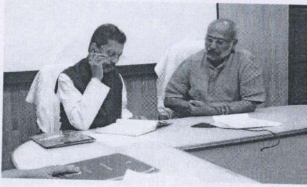
Shri. Deepak Vasant Kesarkar, Hon'ble Minister of State for Home (Rural), Finance, Planning, Government of Maharashtra in discussion with Shri. C P Radhakrishnan Ex MP, Chairman, Coir Board and reviewing the developments of coir industry in the State of Maharashtra