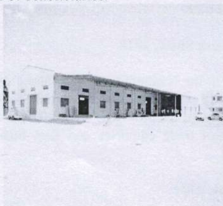
Common Facility Centre (CFC) of Kangeyam coir cluster