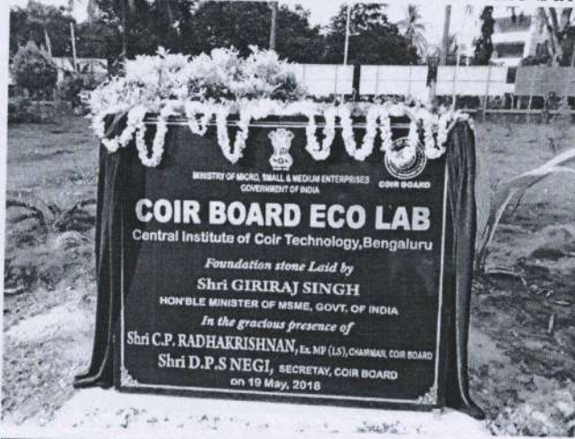
Shri. Giriraj Singh, Hon'ble Minister for MSME laid foundation stone for the building of ECOLAB at CICT, Bangalore on 19.05.2018 under the ATI Scheme of MoMSME