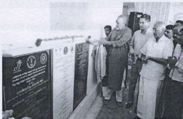
Shri. Giriraj Singh, Hon'ble Minister for MSME inaugurating the CFC of Kangeyam Coir Cluster on 18.05.2018