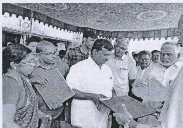
Shri.Kamalakannan, Hon'ble Minister for Agriculture & Education, Govt. of Puducherry viewing the coir products displayed in the Regional Seminar