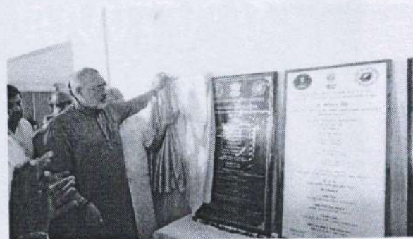
Common Facility Centre (CFC) of Palladam coir cluster of Shri. Giriraj Singh, Hon'ble Minister for MSME inaugurating the CFC of Palladam Coir Cluster on 18.05.2018