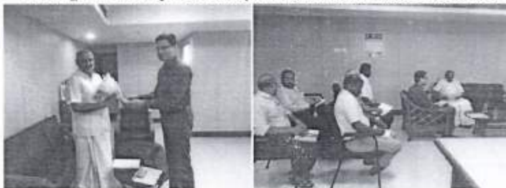
Meeting with Principal Secretary/Industries Commissioner, Officials of Director of Industries and Commerce in Chennai

Shri.C.P.Radhakrishnan Ex.MP, Chairman, Coir Board had a meeting with Principal Secretary/Industries Commissioner and Director of Industries and Commerce, Additional Commissioner, Director of Industries and Commerce and other superior officials in connection with allotment of space for setting up Regional centre cum Industrial Promotion Centre in Chennai and cluster related matters implemented in Tamilnadu including MSME Cluster and SFRUTI Cluster, other related development activities of coir in Tamilnadu and