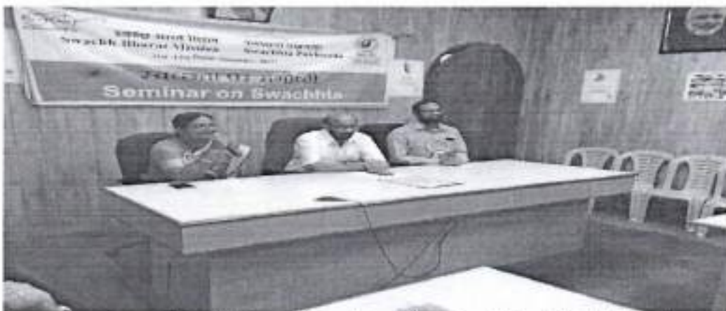
Seminar on Swachhata and Valedictory function of Swachhta Pakhwada –

9. 15 th December 2017 :- Seminar on Swachhata and Valedictory function of Swachhta Pakhwada –