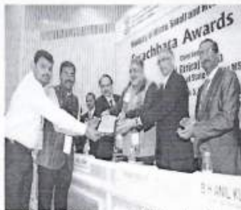
MSME Swatchhata Awards 1st prize Neyyattinkara Cluster and 11nd prize Kangayam Coir Cluster