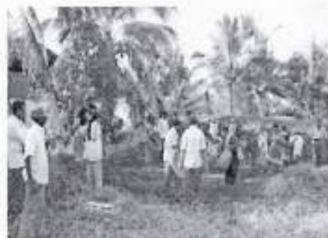
Arachalur, Anthiyur, Kodumudi and Erode were demo sites in Tamil Nadu