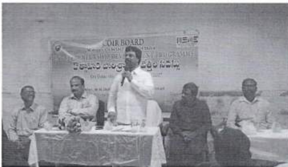
EDP organised by Regional Office, Hyderabad