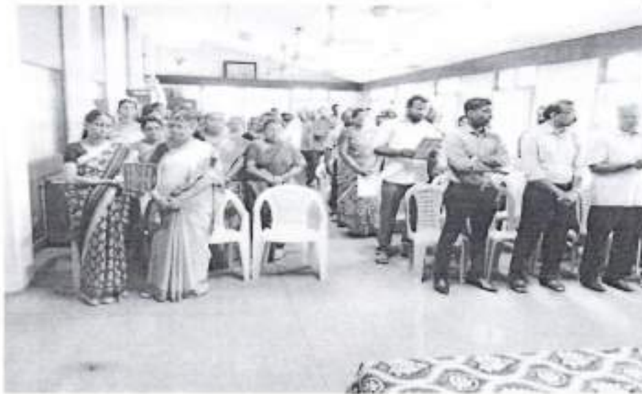
"3 rd Constitution Day" observed at Coir Board Head Office on 27 th November 2017 by taking pledge.