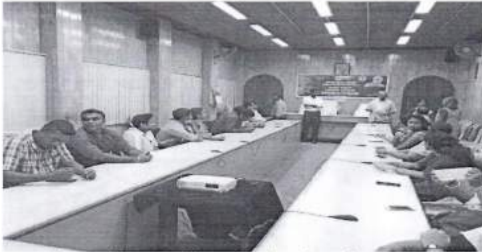
Slogan writing competition on Swachhata for employees of the Coir Board.

7. 13 th December 2017 :- Slogan writing competition on Swachhata for employees of the Coir Board.