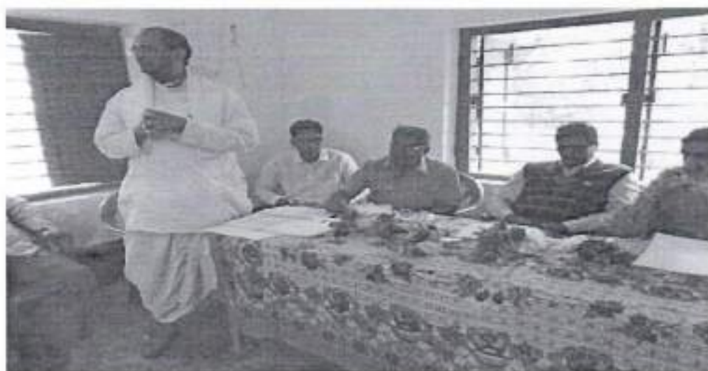
SPV formation meeting (SFURTI- II BHOGRAI COIR CLUSTER)