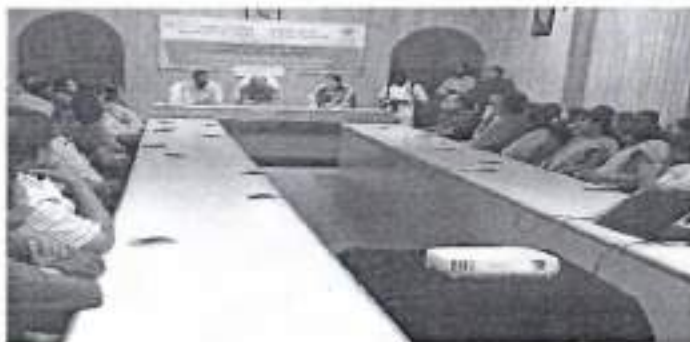
Awareness Class on "Hygiene and Hand washing" at Coir Board Head Office.

6. 12 th December 2017 :- Awareness campaign on Swachhta to motivate employees - Screening of films on Swachhta & Awareness Class on "Hygiene and Hand washing" and Screening of films on Swachhta at Coir Board Head Office.