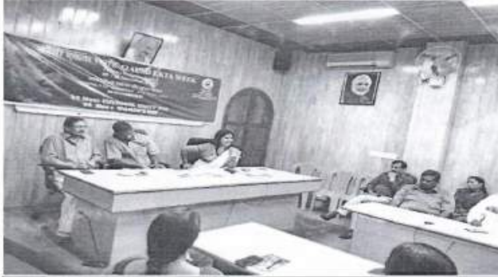
Speech on Women empowerment by Smt.Thanuja Bhattathiri, famous writer and women activist at Coir Board Head Office.