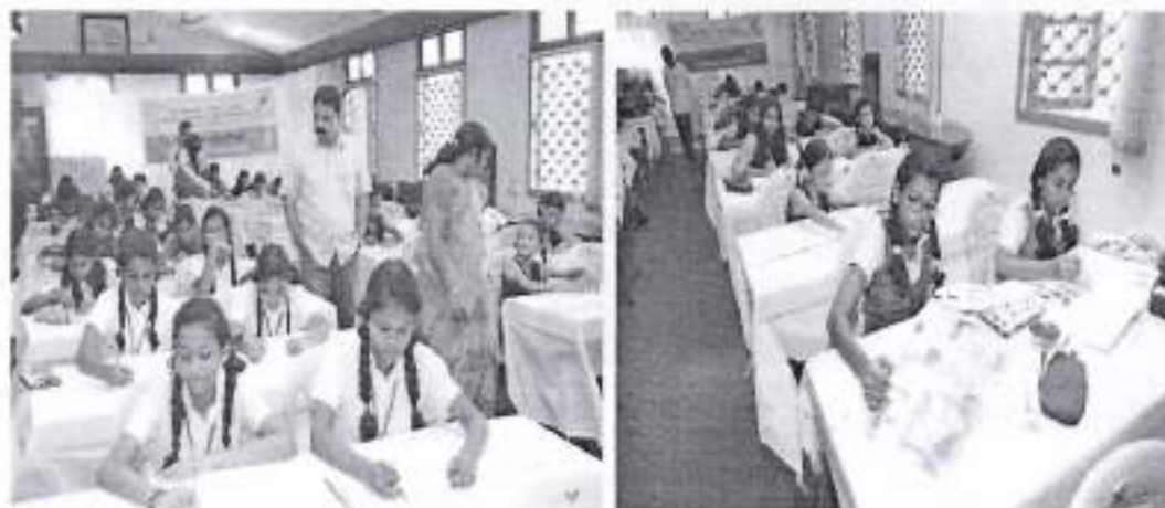
Painting, Slogan Writing, Poster making competitions