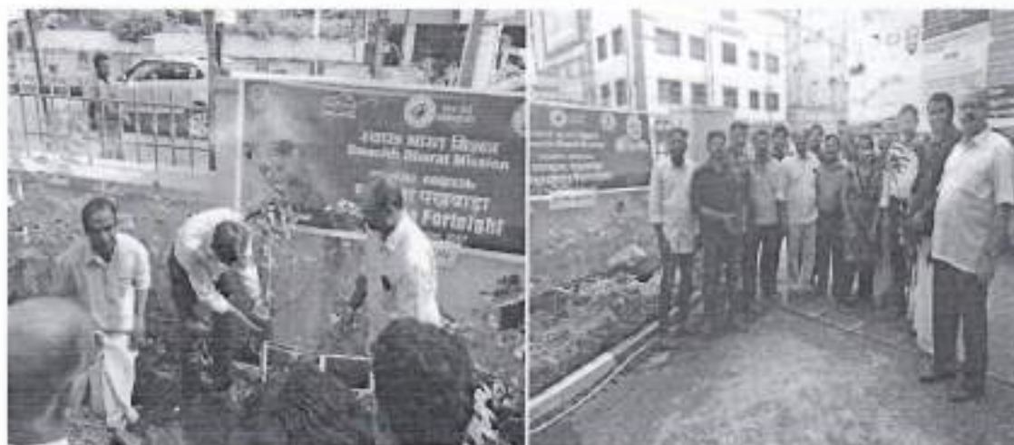
Plantation drives in Offices

5. 10 th December 2017 :- Plantation drives in Offices