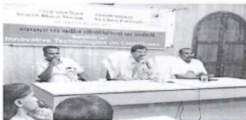
Conducted a Seminar on 'Innovative Technologies on Cleanliness'

4. 9 th December 2017 :-Conducted a Seminar on 'Innovative Technologies on Cleanliness'