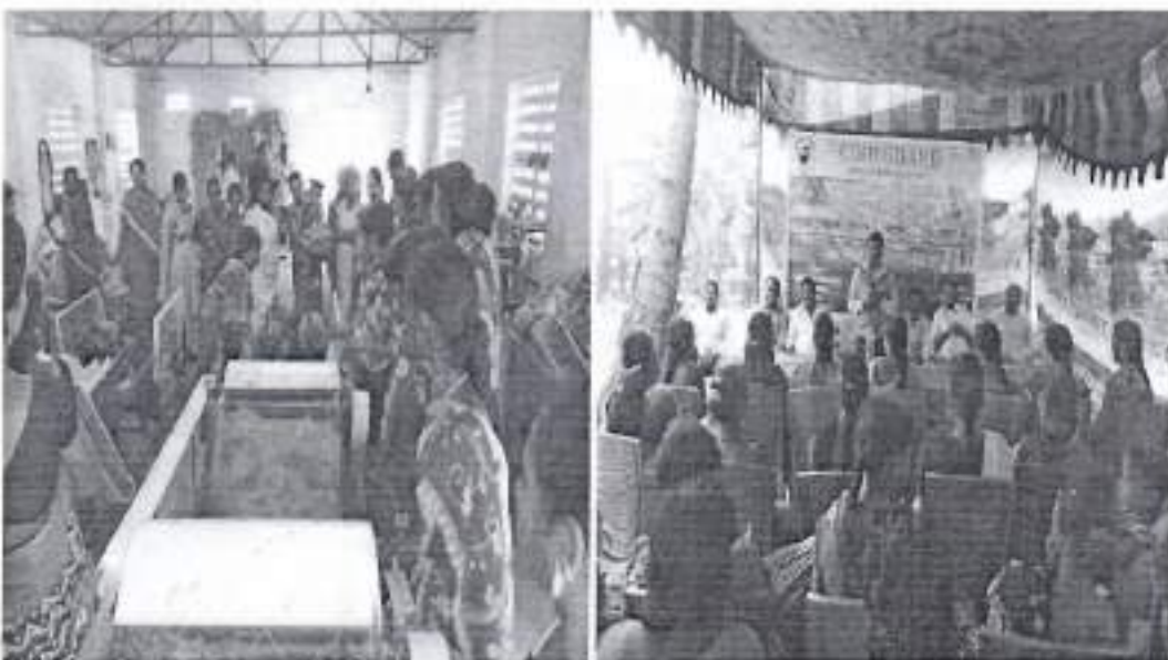
HRD Programme organised at RO Rajahmundry