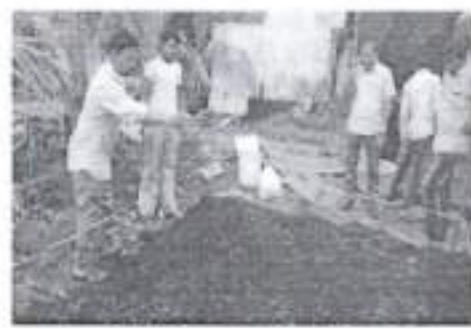
Vengurla, Kudal and Sawantwadi were visited by the other team at Maharashtra.