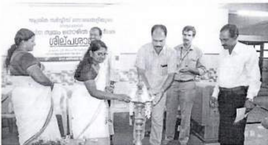
Workshop organised by Sub Regional Office, Kannur