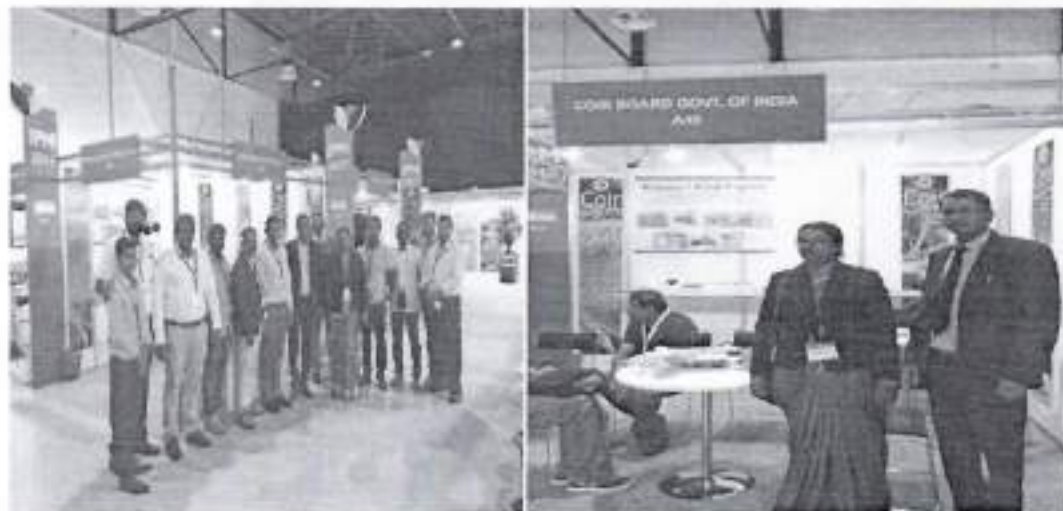
Participation of Indian coir sector in the International Plants Expo Middle East ( IPM Dubai, UAE)

12 firms were newly registered as Coir Exporters and also issued Registration-Cum-Membership Certificates.