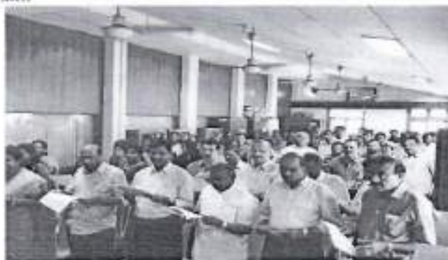
Coir Board employees took Swachhata Pledge