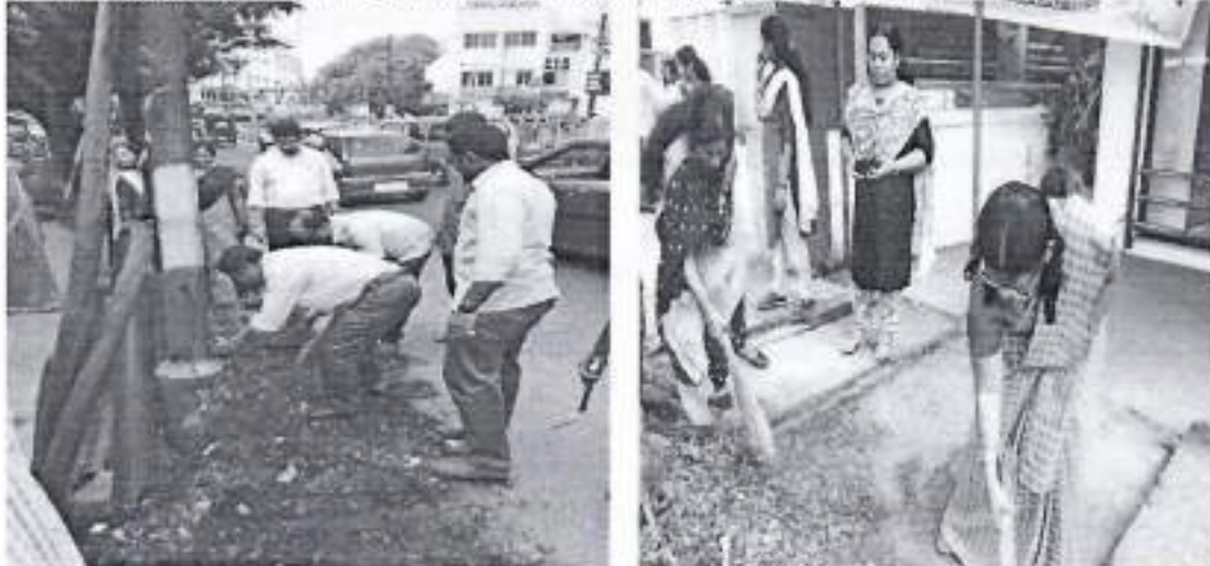
Cleanliness drive at the approach road of the office

8. 14 th December 2017 :- Cleanliness drive at the approach road of the office :