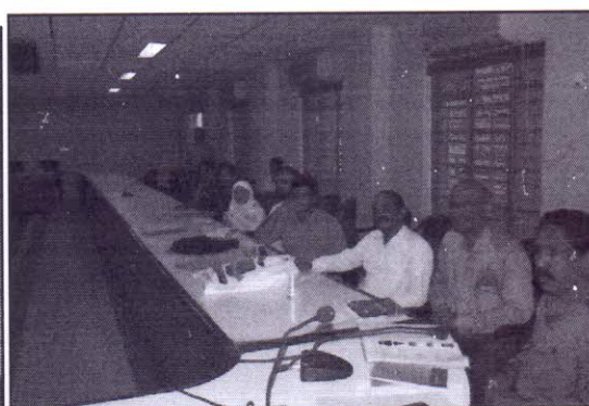
Incubation Training Programme at CCRI

Diversified coir products and coir jewellery are being developed for display in various exhibitions organized by Coir Board.