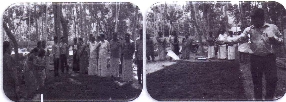
Demonstration of Coir Krishi Mithra at Trivandrum Dist.

The innovative technology of urea-less composting was also demonstrated in Palakkad and Calicut at 4 different locations viz.