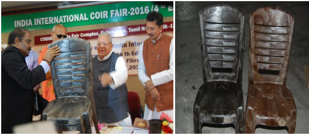
Launch of Injection moulded chairs from Coir