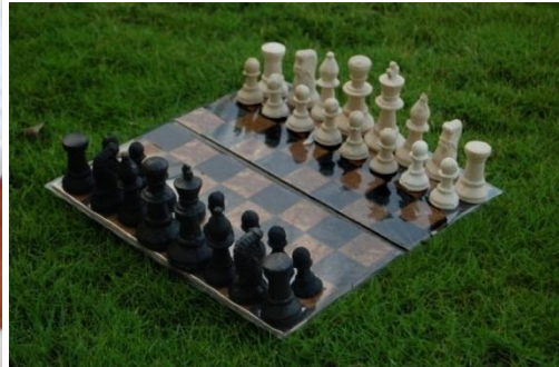
Launch of Coir Chess Board & Coins at the IICF-2016