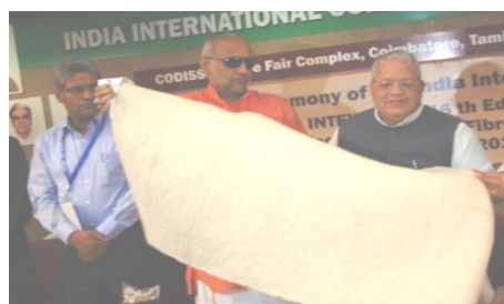
Yoga mat made from Coir Silk