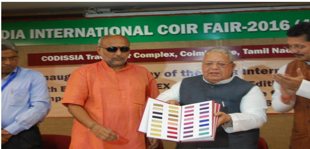
Launch of PANTONE shades on coir at the IICF-2016