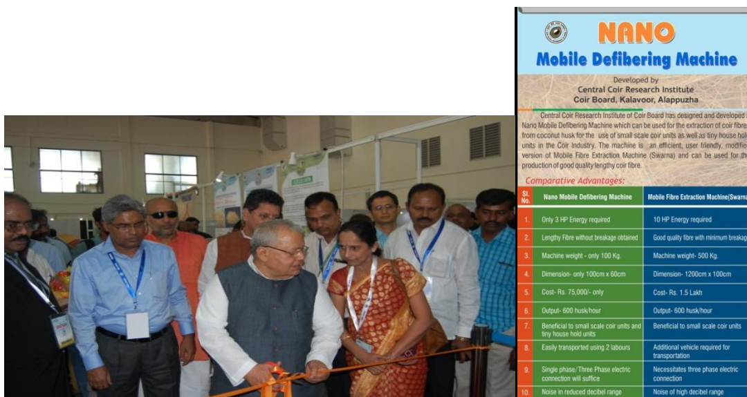
Inauguration of “NANO” the low decibel user friendly Coir fibre Extraction Machine