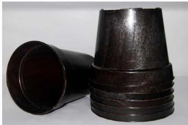
Injection moulded Coir- Poly Propylene Pots