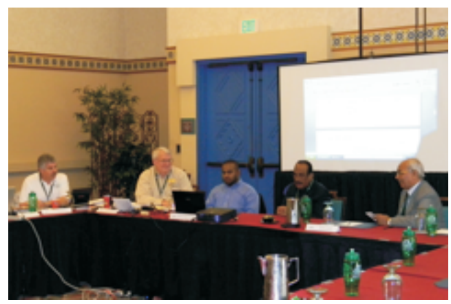
Chairman addressing the IECA Board