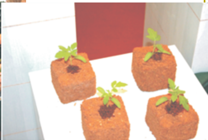
Coir pith an ideal growth medium for horticulture