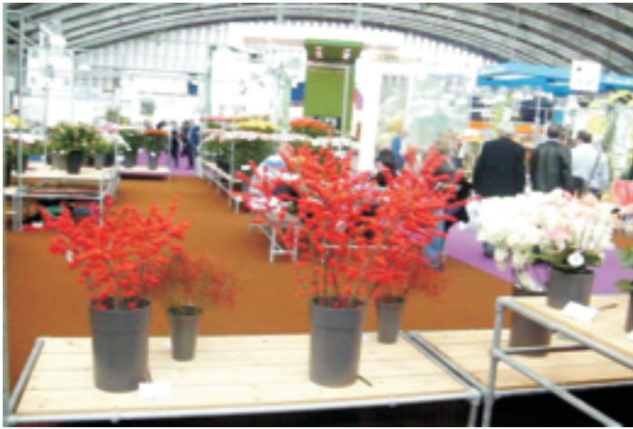
Floriculture in coir pith growth substrate