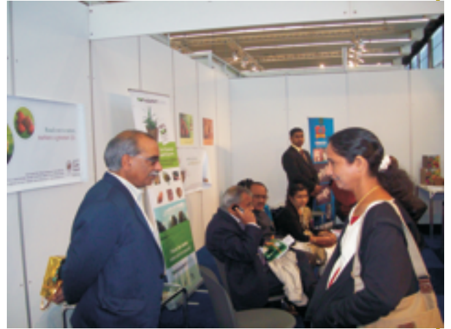
Officials from the Netherlands Embassy at the Coir Board Booth