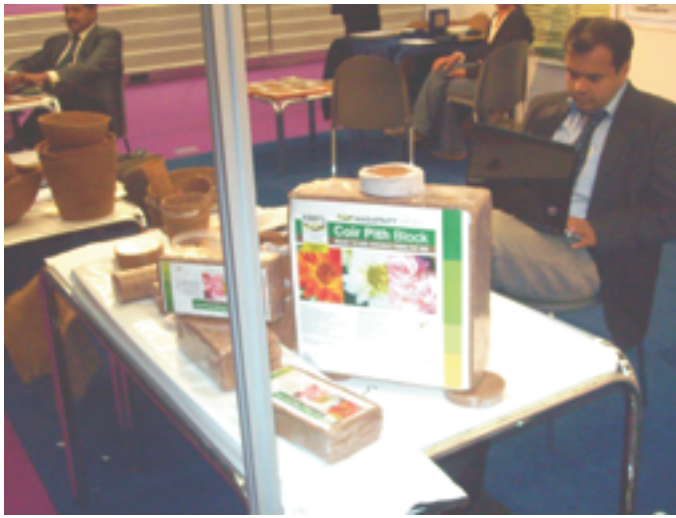
Exporters with Garden Articles displayed at the Horti Fair