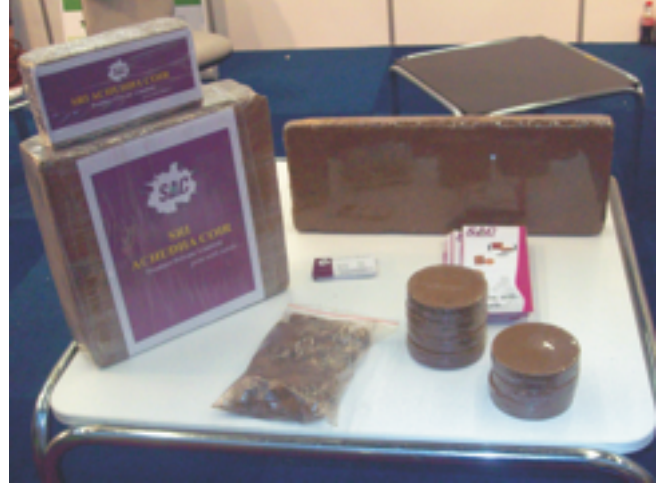
Exhibits displayed in the Coir Board booth at the Horti Fair.