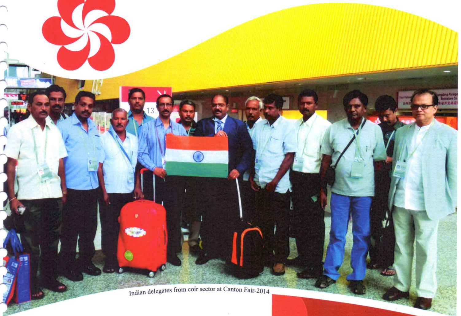
Indian delegates from coir sector at Canton Fair-2014